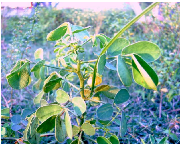
Fig. 1: Plant morphology